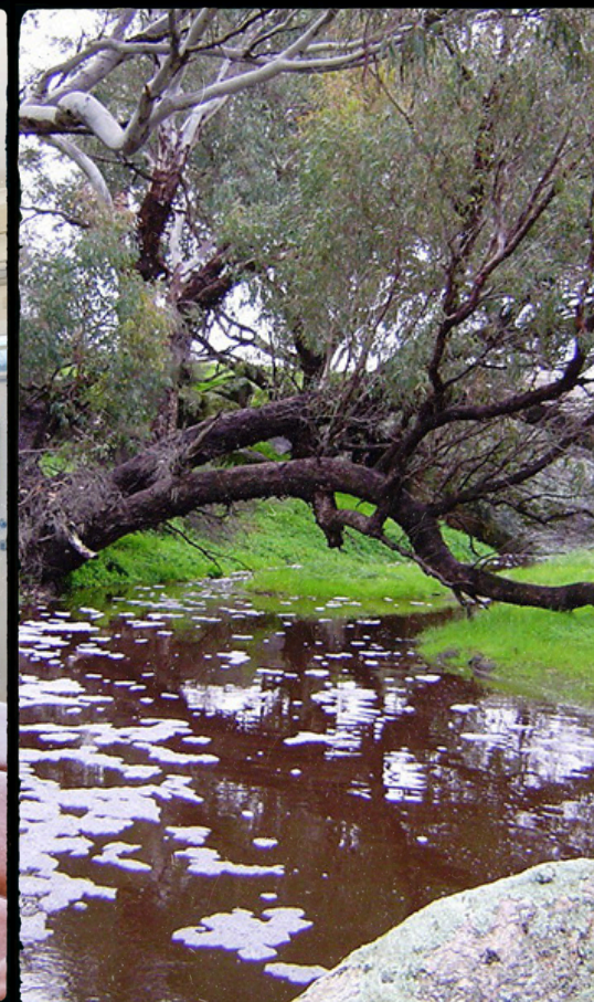
Hillside Country Retreat, York, WA