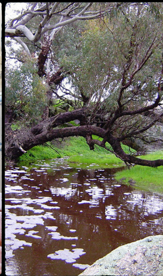
Hillside Country Retreat, York, WA